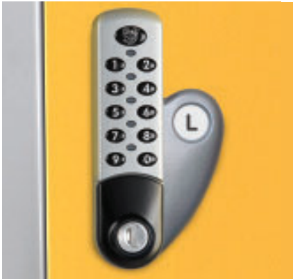
7. Digital Combination Lock TYPE L