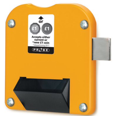
6. Coin / Token Return or Retain Lock TYPE H-£1