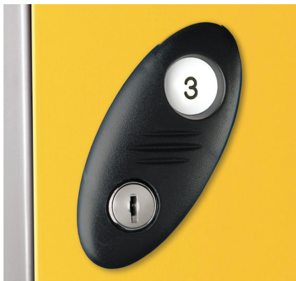
1. Cam Lock TYPE A