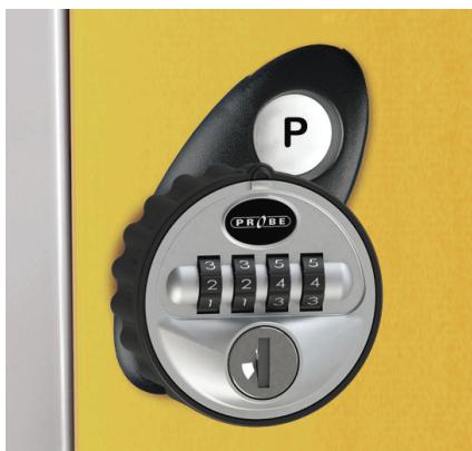
4. Combination Lock TYPE P