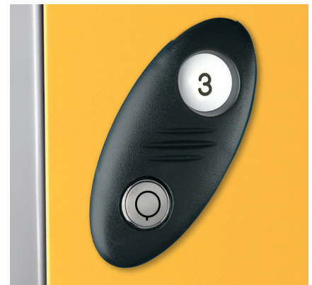
3. Radial Pin Lock TYPE C