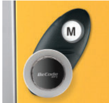
8. BeCode Air+ RFID Technology Lock TYPE M