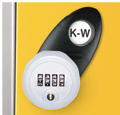
5. Re-programmable Combi Lock (using reset button) TYPE K