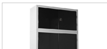
1 x Modular Tall Cupboard - 3 Shelves H2300 x W900 x D600mm