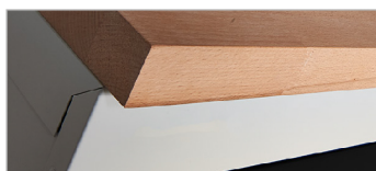
1 x Modular Solid Beech Work Surface W2100 x D650 x H40mm