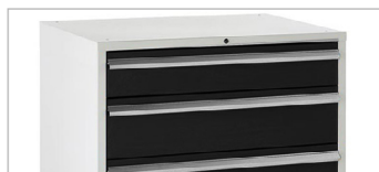
1 x 900 Euroslide Cabinet - 4 Drawers H822 x W900 x D650mm