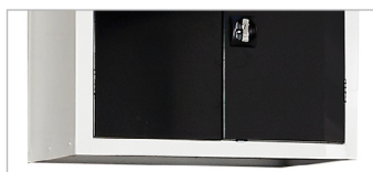
1 x Modular Double Wall Cupboard H700 x W915 x D450mm