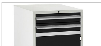
2 x 600 Euroslide Cupboard + 2 Drawers H822 x W600 x D650mm