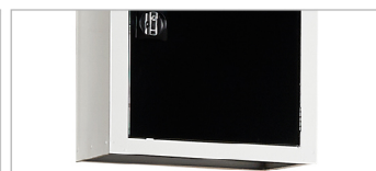
2 x Modular Single Wall Cupboard H700 x W615 x D450mm