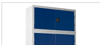
1 x Modular Tall Cupboard - 3 Shelves H2300 x W900 x D600mm