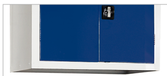
1 x Modular Double Wall Cupboard H700 x W915 x D450mm