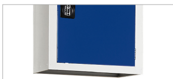
1 x Modular Single Wall Cupboard H700 x W615 x D450mm