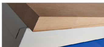
1 x Modular Solid Beech Work Surface W2100 x D650 x H40mm